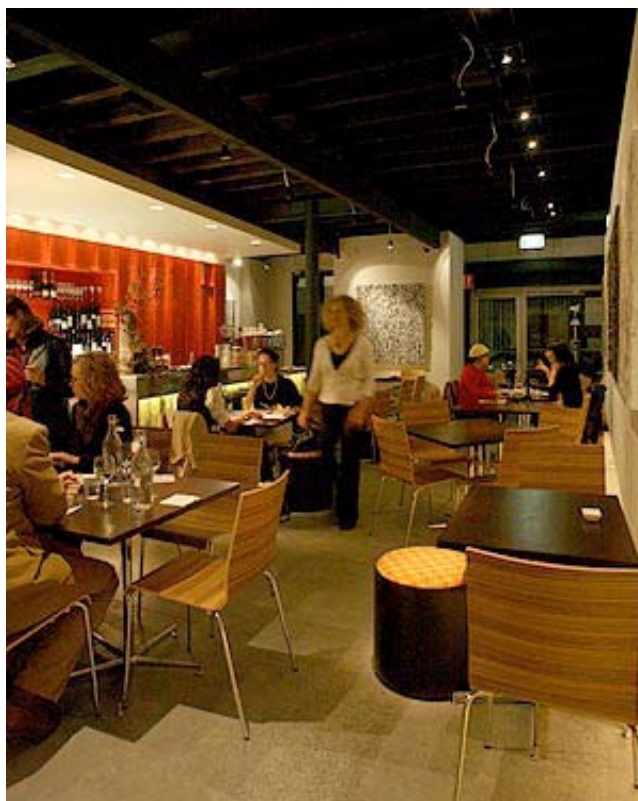
Hip in Chippo - Mission Restaurant and Bar.

This is when Mission's true merits strike us. It's more than a bar but then it's not exclusively a restaurant. It feels casual enough to drop in for an impromptu drink, bite and chat, and special enough to book and dine for a particular occasion. Lucky local residents and workers dropping in for